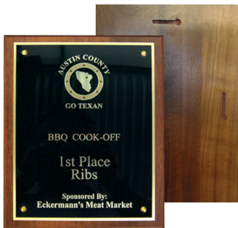
LASER ENGRAVED WALNUT VENEER PLAQUE