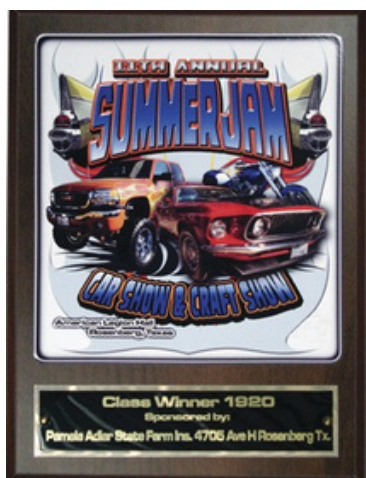
DIGITAL PLAQUE WITH LASER ENGRAVED PLATE

WARNING: Cancer and Reproductive Harm - www.P65Warnings.ca.gov