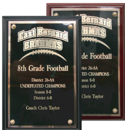
LASER ENGRAVED BLACK OR MAHOGANY PLAQUE

WARNING: Cancer and Reproductive Harm - www.P65Warnings.ca.gov